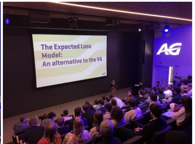
From top to bottom: Insights at NBB and AG Insurance